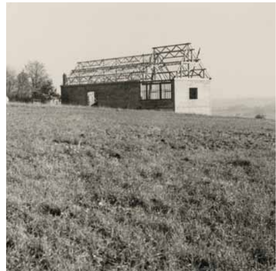
Construction of Calder's new studio, Saché, 1963