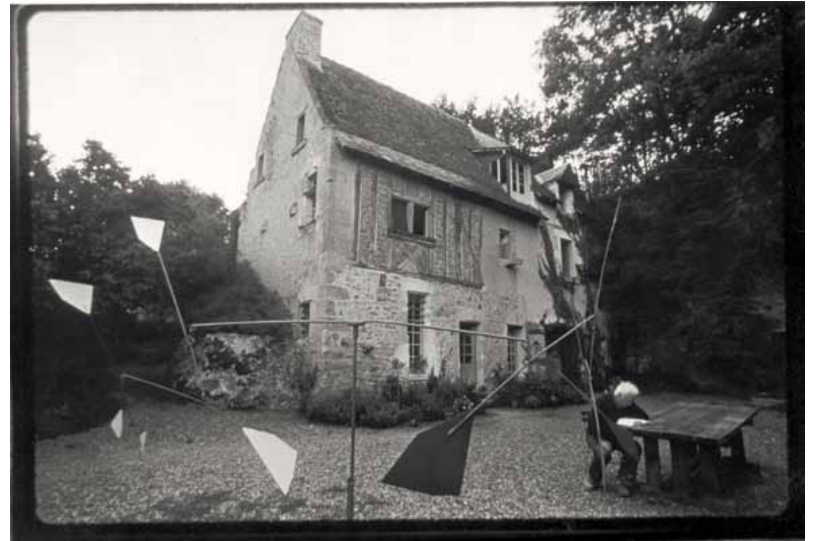
Calder with Les Granettes (1953) outside François Premier, Saché, ca. 1965.

In reading Calder's autobiography—which is in fact a series of recollections recorded by Jean—I was struck by his permanent state of enchantment with found and recovered objects. Sometimes his reaction was to take these objects and turn them into art, while preferring to call them something else. Sometimes it was to make useful stuff for his personal environments, like kitchen utensils or furniture. Sometimes that useful stuff rises to the level of what we could call architecture. After all, architecture, like art, exists less in a clearly bounded, sacral domain than on a continuum with, or as an insertion into or a riff on, the fabric of life itself. An important aspect of Calder's modernity lies in his intuitive understanding of this, and also in his resistance to the critical taxonomies by which we pigeonhole things for our own mental safety and convenience. His friend Jean Prouvé once famously said that there is