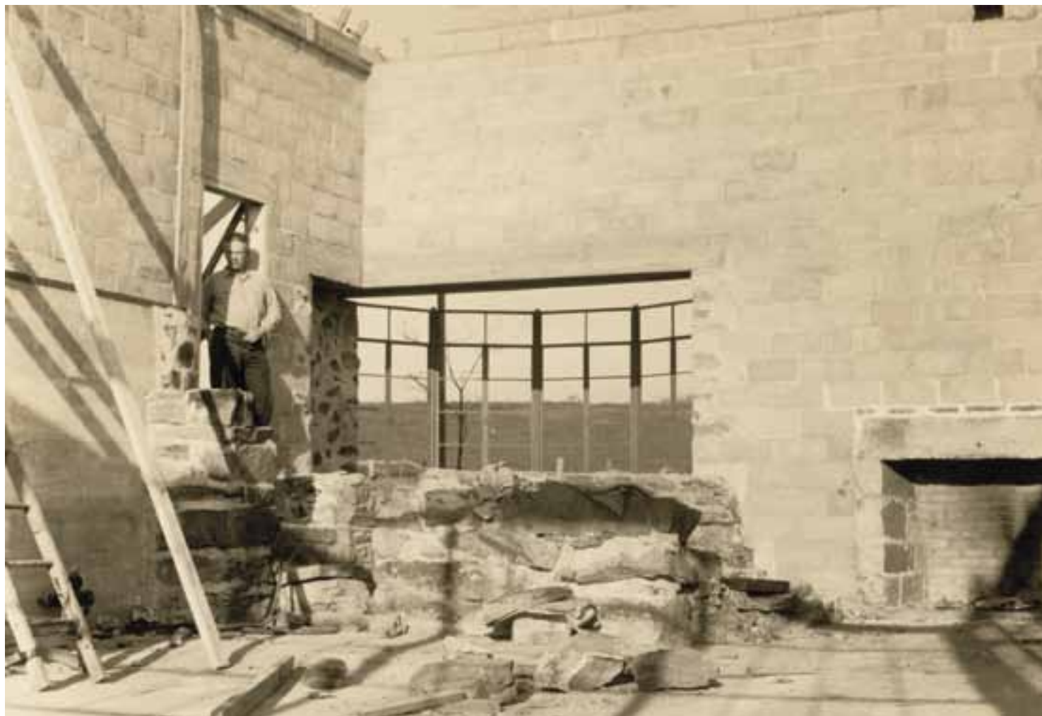
Calder during construction of his Roxbury studio, 1938

Roxbury was built at the tail end of the Depression and the eve of war. Whatever magpie habits Calder had already developed as an artist were reinforced by the material penury that prevailed. He recalls cutting up his aluminum boat (itself a homemade object for puttering around the pond) around 1942 to use the scrap metal in artworks (and around the house). Later in life, when his cash flow improved, he bought a contiguous parcel of land in Roxbury rather than upgrading or expanding the existing studio. He needed a change of venue in order to revise his work space.